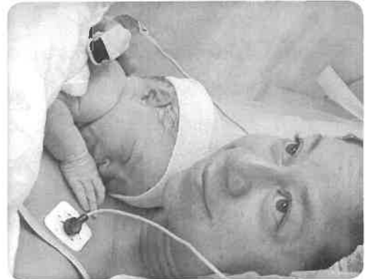
This mother holds her baby skin to skin as her surgery is being completed